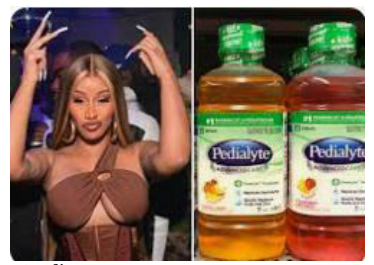
Cardi B NY Post